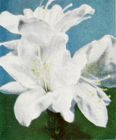
AZALEA ROSE GREELY (Gable) One of the Best White Azaleas